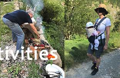
7 / Free activities