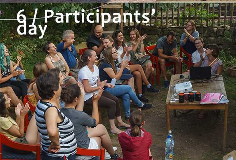
6 / Participants' day