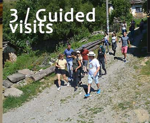
3 / Guided visits