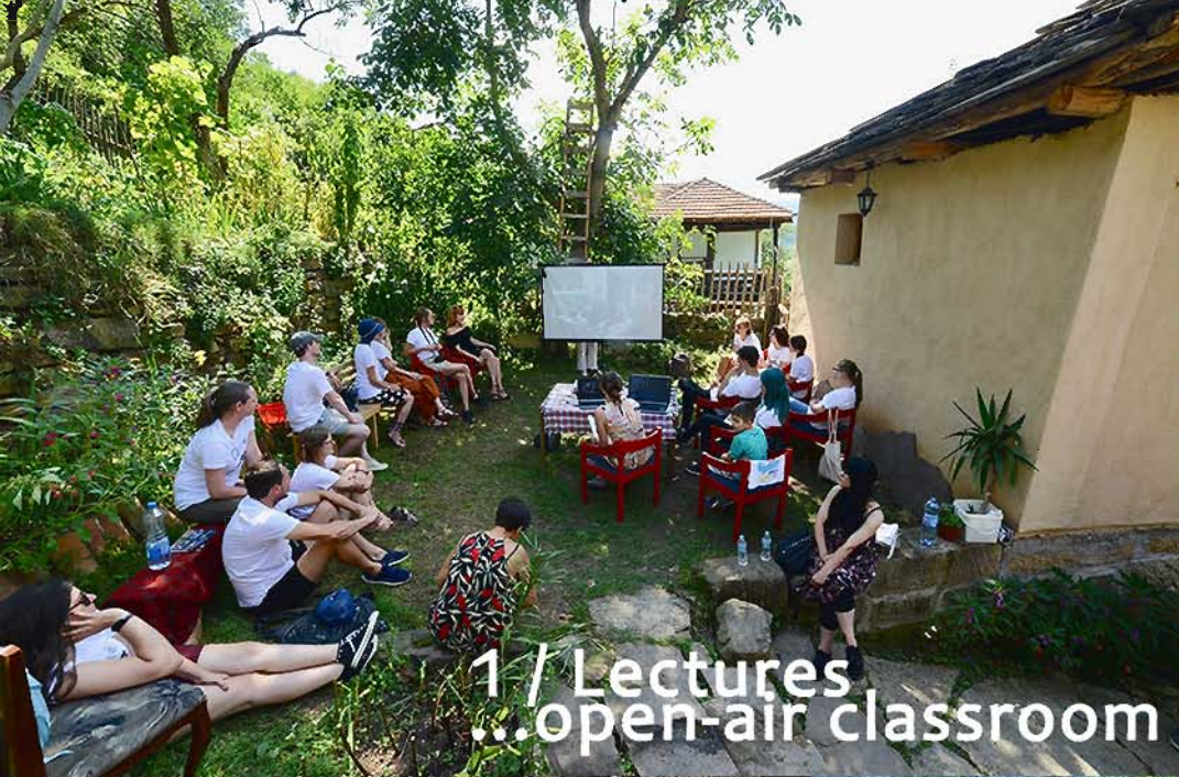
1 / Lectures ...open-air classroom