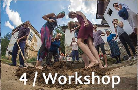
4 / Workshop