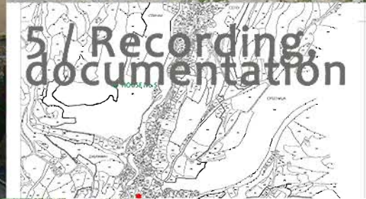
5 / Recording documentation