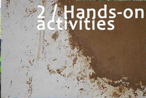
2 / Hands-on activities